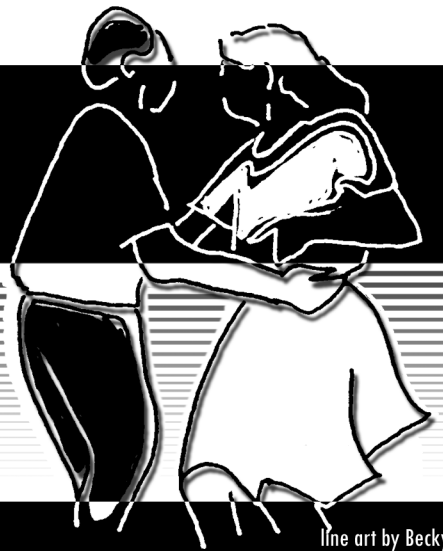
line art by Becky Hill

THE NEWSLETTER OF THE NORTH BAY COUNTRY DANCE SOCIETY