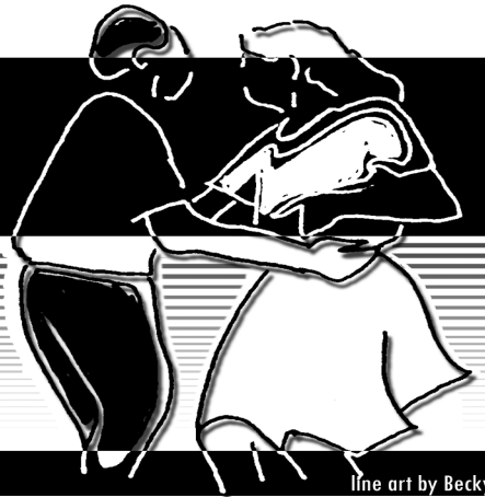
line art by Becky Hill

THE NEWSLETTER OF THE NORTH BAY COUNTRY DANCE SOCIETY